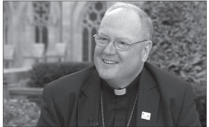
Cardinal Timothy Dolan

“For instance, under the proposed Reproductive Health Act, doctors would not be required to care for a baby who survives an abortion. The newborn simply would be allowed to die without any legal implications,” wrote Dolan.... Dolan said believes that the Democrats of today have abandoned many of the tenets that made the party attractive to Catholics generations ago. Dolan also pointed to other issues, including school choice