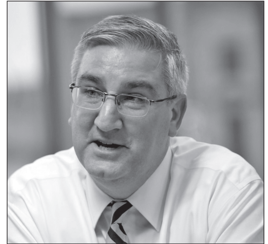
Indiana Governor Eric Holcomb

“Indiana Right to Life applauds the passage of SB 203 as a powerful step forward in recognizing and protecting the full humanity of unborn children at any stage of development. The recognition of the worth of a child killed during a felony further places Roe v. Wade on a collision course with law and history. We are committed to doubling down on efforts to bring about a majority on the Supreme Court that will strictly interpret the constitution, dismantle Roe, and provide full protection for all unborn children, including those who are targeted for abortion.”